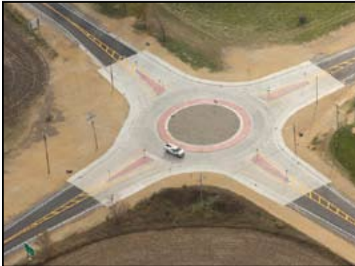
The Michigan Concrete Association selected the Genesee County Road Commission's Hill and Elms roads roundabout (above) on the border of Gaines and Mundy townships, MI as the winner in the Intersections Category. They chose the City of Fenton's Red Fox Outfitters parking lot (right) as winner of the Pervious Concrete Category.