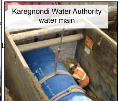
Karegnondi Water Authority water main