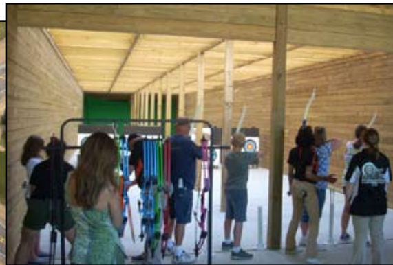
At left, the City of Farmington Hills' Riley Archery Range received a Facility Design Award from the Michigan Recreation and Park Association.