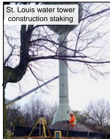
St. Louis water tower construction staking