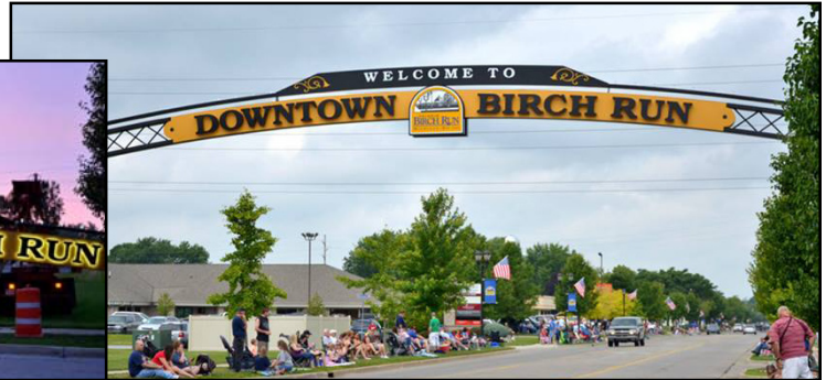
At left, the arch is assembled; at right, the arch welcomes people to the Fourth of July parade.